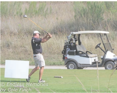
© Endless Memories by Cole Finch