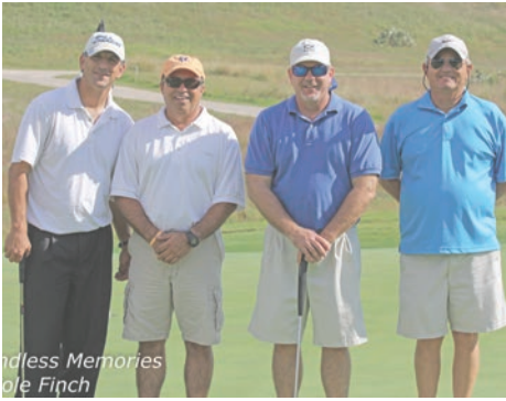
Endless Memories by Cole Finch