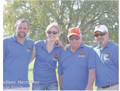
Endless Memories by Cole Finch