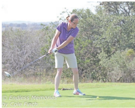
© Endless Memories by Cole Finch