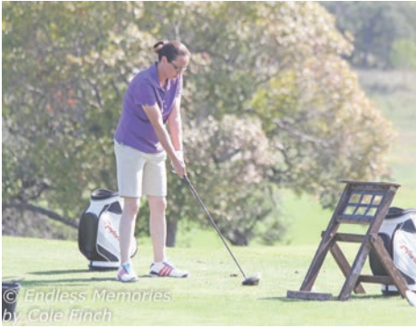
© Endless Memories by Cole Finch