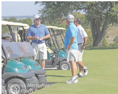
© Endless Memories by Cole Finch