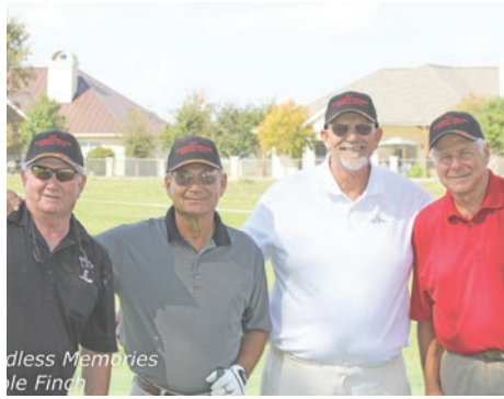
Endless Memories by Cole Finch