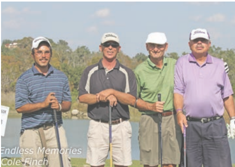
Endless Memories by Cole Finch