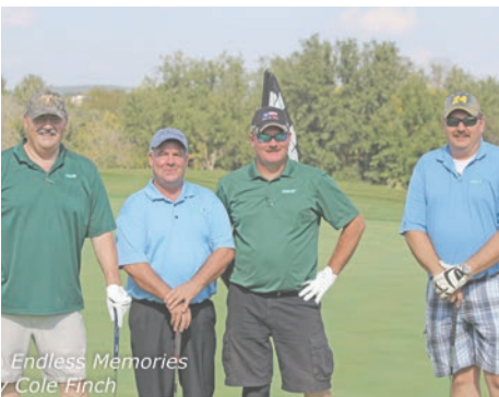
© Endless Memories by Cole Finch