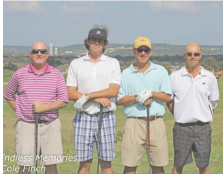
Endless Memories by Cole Finch