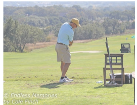
© Endless Memories by Cole Finch