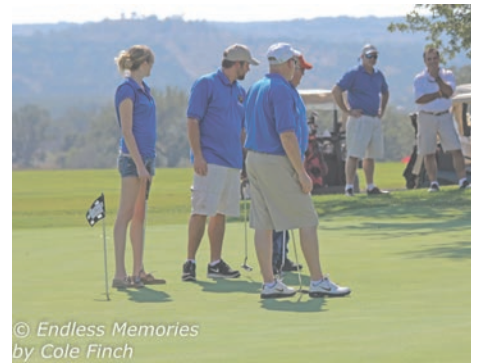
© Endless Memories by Cole Finch