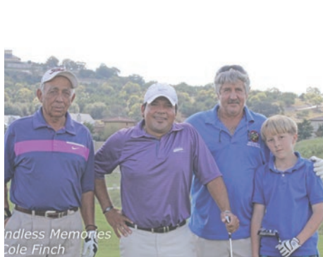
© Endless Memories by Cole Finch