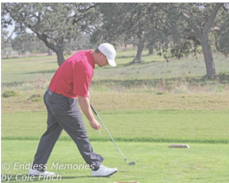
© Endless Memories by Cole Finch