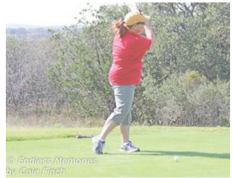
© Endless Memories by Cole Finch