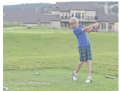
© Endless Memories by Cole Finch