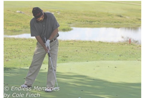
© Endless Memories by Cole Finch