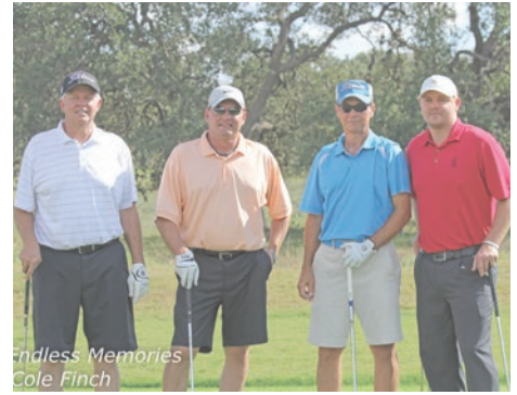
Endless Memories by Cole Finch