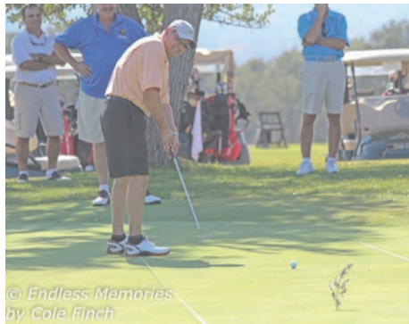
© Endless Memories by Cole Finch